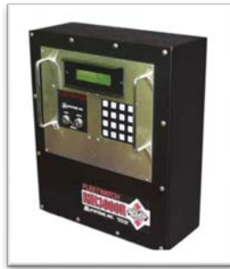
Figure 1: Fleetwatch RIH 3000R