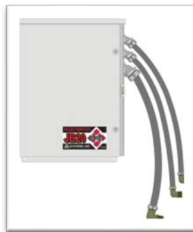
Figure 2-Fleetwatch JB20 Junction Box