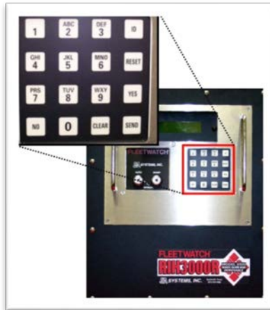
Figure 6: Press RESET on keypad to clear any irregularities and start with new prompt.

Please call S&A Systems, Inc. at (972) 722-1009 x32 for system validation or if you have any questions.