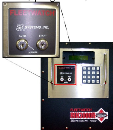
Figure 5: Performing a key reset with the key-switch tells the server to initialize the RIH.